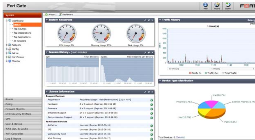
FortiOS Dashboard — Single Pane of Glass Management

Fortinet FortiCare support offerings provide comprehensive global support for all Fortinet products and services. You can rest assured your Fortinet security products are performing optimally and protecting your users, applications, and data around the clock.